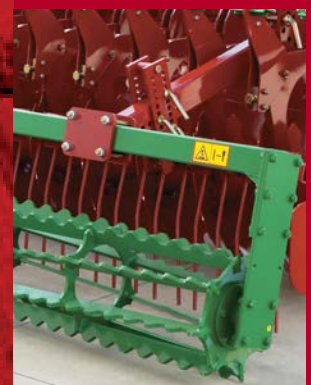
Notched plate roller 400 mm