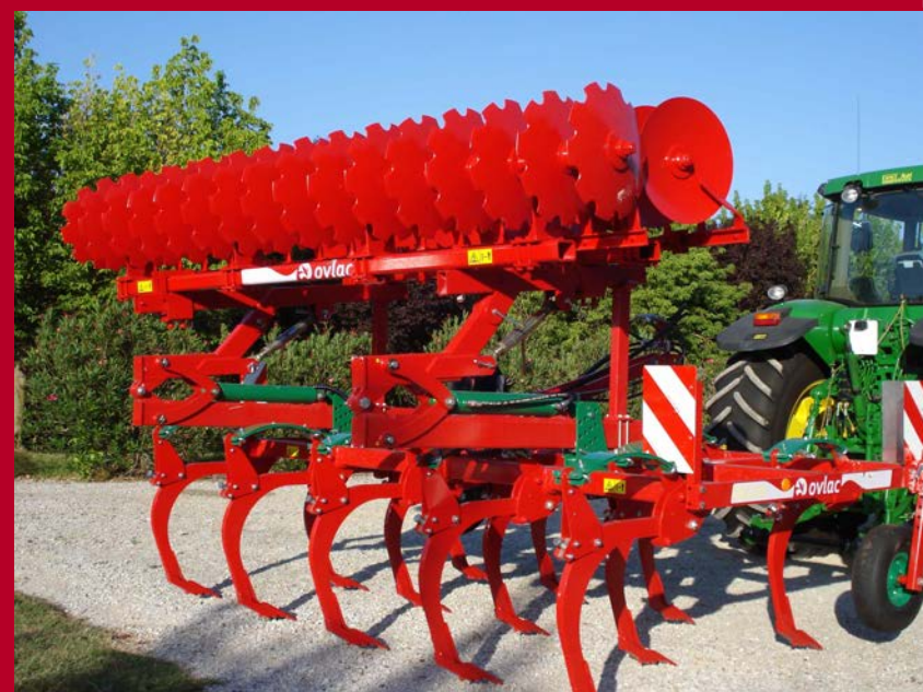
Rear "V" disc harrow with hydraulic folding on top of the CH for transport