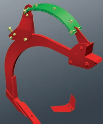
Fitted with reversible plough point. Wing shares can be fitted as an option.