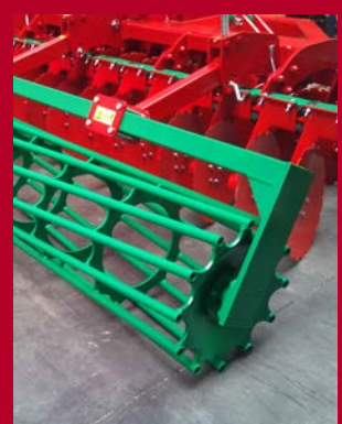
Cage roller 450 or 540 mm