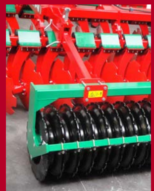
V-Profile Double Disc Roller