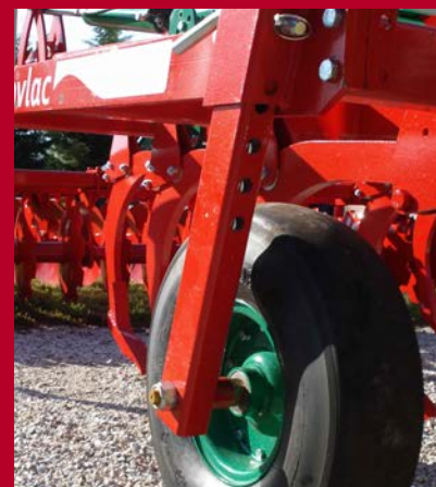
Side wheels for a better depth control